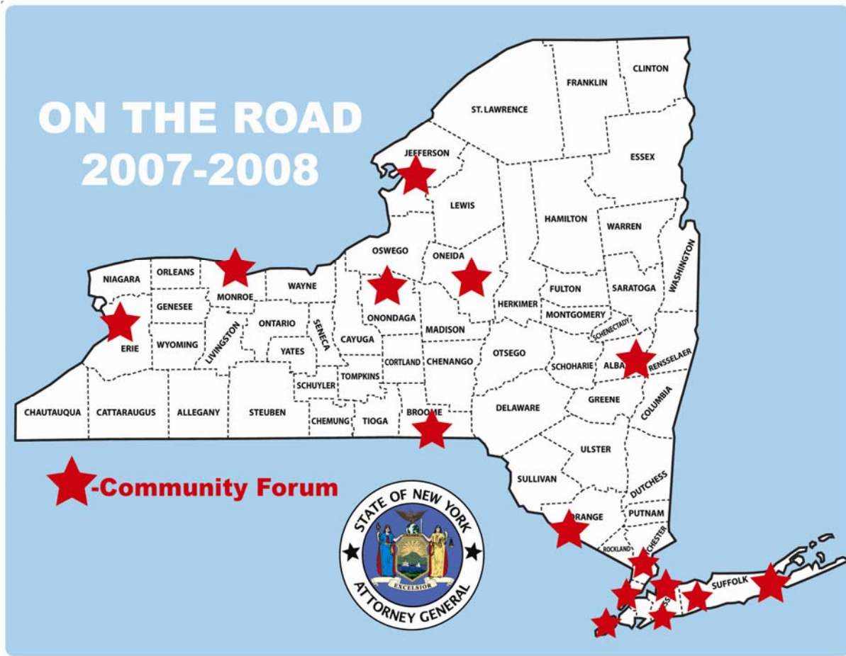
Map 1 – Regions Toured on the Road

One of the specific complaints that the OAG receiving during 2007 and early 2008 was that health insurers in New York and nationwide were underpaying consumers and their physicians for out-of-network care. Consumers also expressed confusion about how insurers were determining the rate of reimbursement for out-of-network care.